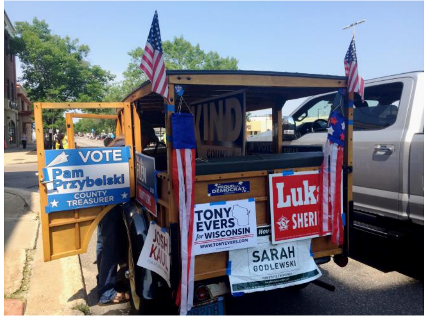
Proud Dems lead the parade