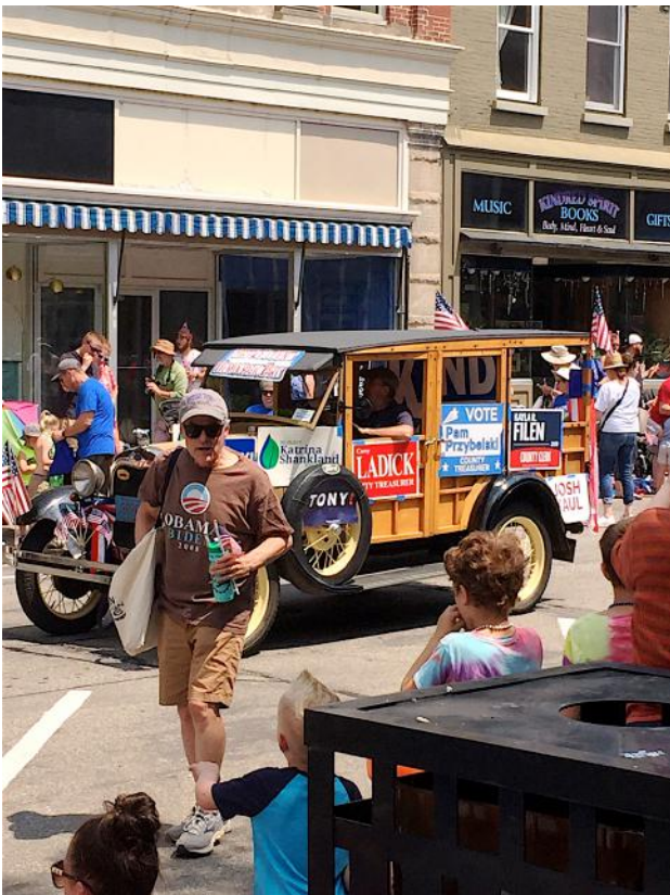
Dem Supporters visible in Downtown Point on 4th