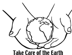
Take Care of the Earth

If we all do our part by making an effort to be conscious of how we are impacting the future of our planet, we can save it for the generations that will follow us.