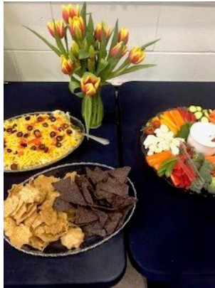
Of course there was food!