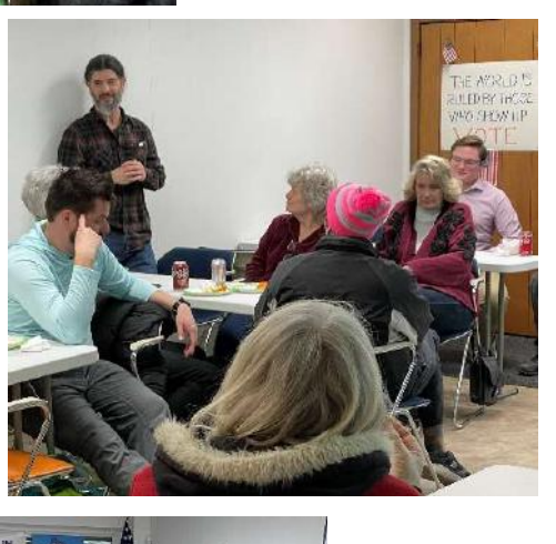
We had many opportunities to meet our candidates before the election. LWV held forums for School Board, Stevens Point Alders, and Portage County Supervisors.