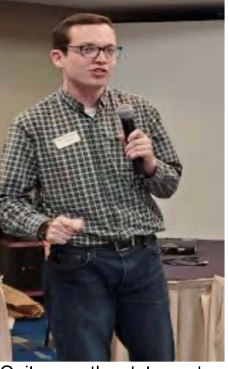
Quite sure the statement below isn't in the Bible but it should be! (no offense intended!)