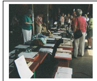
Picnic attendees view silent auction items