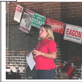
State Senator Julie Lassa addresses picnic attendees.