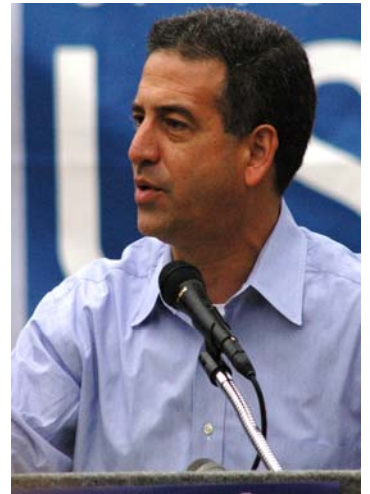
Senator Russ Feingold

I am going to continue to push my legislation, and other measures in the Senate, forward to end the war and safely redeploy our brave men and women in uniform. I sincerely appreciate all of your support. Please continue to write letters to the editor of your local papers and talk to your friends and family to let them know exactly where you stand. Every voice added to our effort brings us one step closer to our goal.